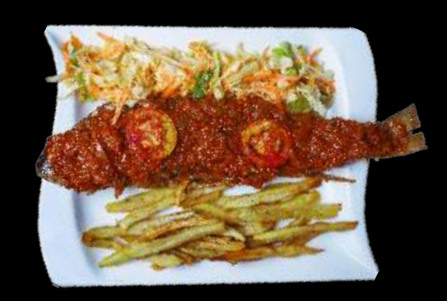
Grilled Croaker Fish