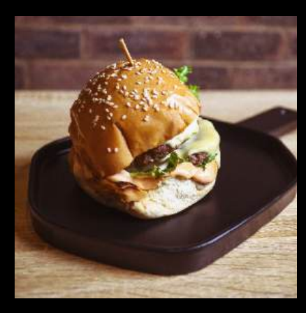
03 Classic Beef

Our signature shawarma dish, hand crafted to perfection with wings and french fries.